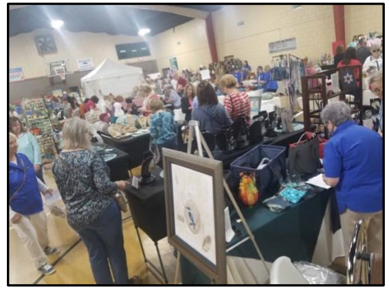
"Vendors and Shoppers"